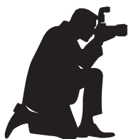
Photo Session for New Members, Board of Directors and Their Spouses/Guests

EVENING ACTIVITIES FOR ALL MEMBERS, REGISTERED SPOUSES AND GUESTS